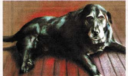
PUPPY LOVE: Don's painting of a Labrador.